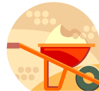
wheel and axle