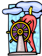
wheel and axle